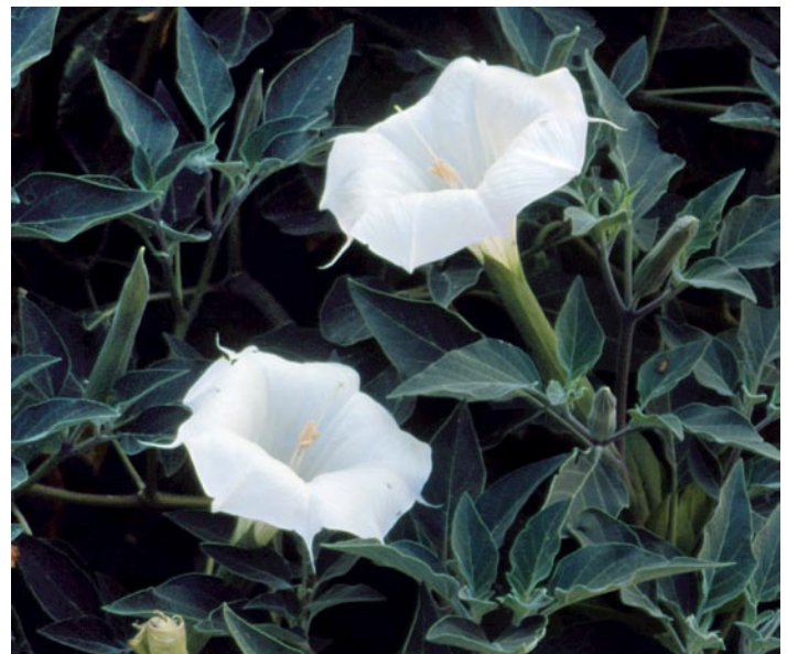
Figure 2. Sacred Datura, Datura wrightii . The white trumpet shaped flowers of Datura may be 20cm deep. Flowers bloom at dusk as night flying pollinators are beginning to fly.

The flowers of Datura provide a rich nectar source for adult moths. While drinking the nectar of the Datura flowers the moths serve as effective pollinators for the plant thereby forming a mutualism where both organisms benefit. Moths, like butterflies, have a very long proboscis that is normally held coiled up close to its face. When feeding, the proboscis is unrolled, and like a long soda straw, is used to sip nectar from the flower. The Datura flowers are so deep that the moths will often climb into the flower to get at the nectar, ensuring pollination in the process.