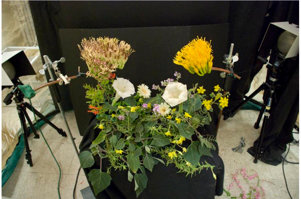
Figure 4. A variety of native flowers were arranged on a low platform inside the flight cage. Green florist foam, soaked in water and covered in black fabric, held the flowers. Two strobe heads were positioned to rim light the subject. Cardboard scrims help keep stray light off of the background.

A small platform was placed in the center of the enclosure. On the platform was set green florist foam, soaked in water and covered with black cloth. Holes were cut in the cloth and the flower stems were poked into the foam to help keep them fresh during the several hours of studio time. Ring stands held the two species of Agave flowers on each side of the arrangement and wet foam was placed on the ends of their stems to help keep them fresh as well (Figure 4).