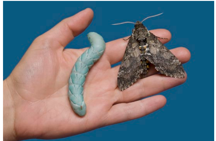
Figure 1. Adult male Manduca sexta , shown with a 5th instar larva. The larvae of Manduca feed on a variety of plants in the nightshade family, Solanaceae, and may often be found “interacting” with tomato and pepper plants in home gardens.

To illustrate the concept of behavioral flexibility and floral preference in Manduca for a possible journal cover, high-speed photographs were made of free flying male moths in the laboratory.